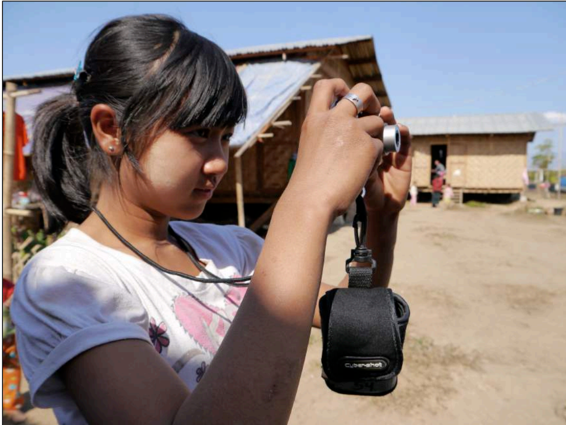
Photo Storytelling Project